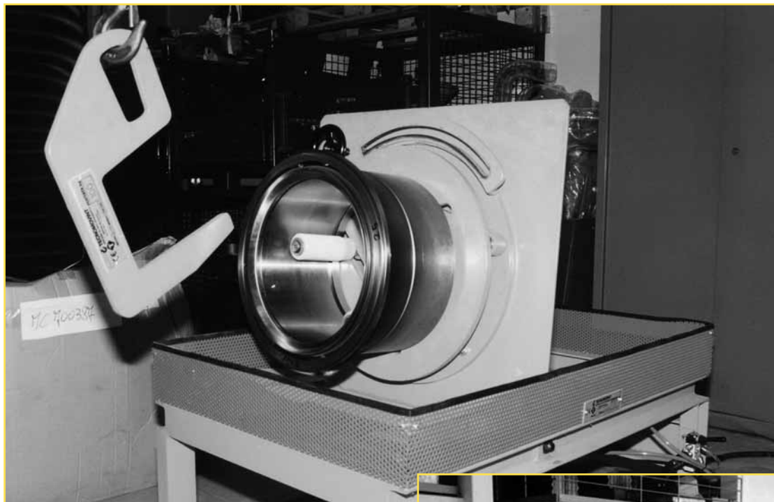
Tipo pneumatico Portate Kg 100 - 300